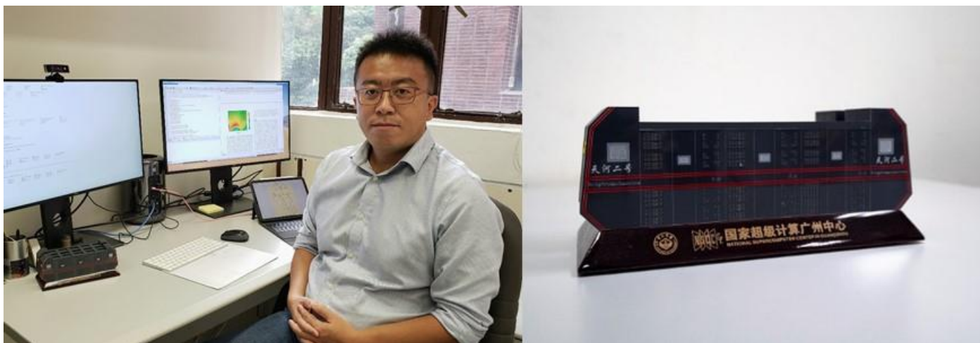
Image 1. Dr Zi Yang Meng achieved accurate model calculations of a topological KT phase for TMGO by performing computation on the Supercomputers Tianhe 1 and Tianhe 2. The above image was the Tianhe-2 supercomputer model.

The powerful supercomputers Tianhe-1 and Tianhe-2 in China used in the computations are among the world’s fastest supercomputers and ranked No.1 in 2010 and 2014 respectively in the TOP500 list ( https://www.top500.org/ ). Their next-generation Tianhe-3 is expected to be in usage in 2021 and will be world first exaFLOPS scale supercomputer. The quantum Monte Carlo and tensor network simulations performed by the joint team make use of the Tianhe supercomputers and requires the parallel simulations for thousands of hours on thousands of CPUs, it will take more than 20 years to finish if performed in common PC.